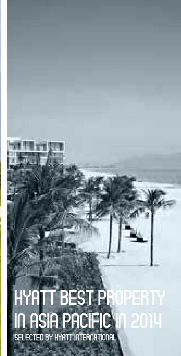
MONTGOMERIE LINKS VIETNAM

HYATT BEST PROPERTY IN ASIA PACIFIC IN 2014 SELECTED BY HYATT INTERNATIONAL